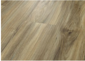
405 Whispering Wood