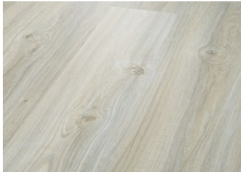
509 Washed Oak