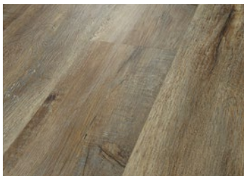
709 Modeled Oak