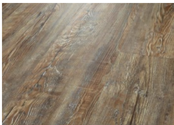
717 Tattered Barnboard