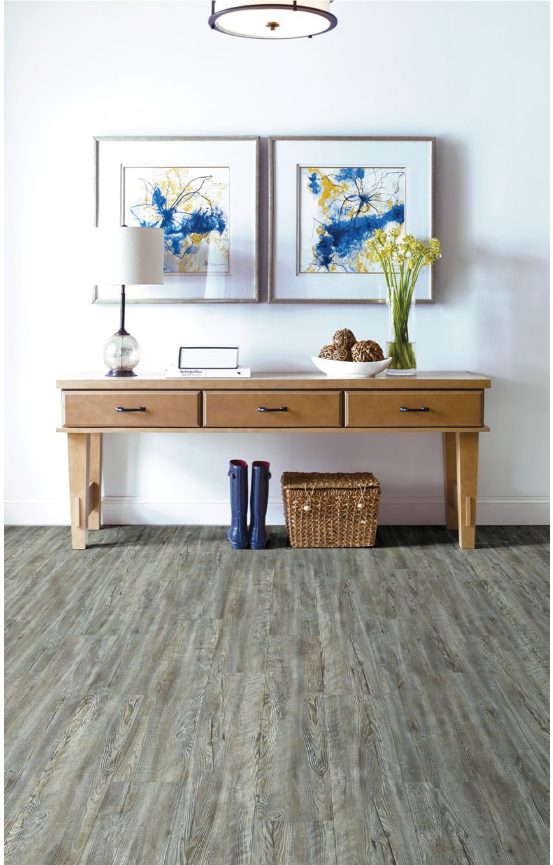
400 Weathered Barnboard